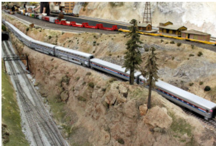
One of many train layouts in Golden StateRR Museum

The Museum's preservation of and access to the children's art is notable. Several exhibitions (1993, 2007, and 2008) derived from the collection have given the viewing public a sense of the rich imaginative material associated with children's visual expression. Another display is planned in conjunction with the publication of the book. Although no specific date for the exhibition and book-signing has yet to be announced, it is anticipated that it will be in early summer.