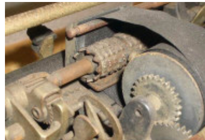
At upper left is the single hammer that moves up and forward, striking the type sleeve seen at center, beneath the inked ribbon. Note the raised type on the sleeve. Ribbon supply reel is at right.

Black with white keys, this typewriter is made of steel and has a cast iron base and keyboard surround. It is 16 inches wide, 6 inches high and 10-1/2 inches deep and weighs about 15 pounds. Although in need of cleaning and oiling, the Museum's typewriter seems to be in working order. The carriage moves with each keystroke, albeit sluggishly, the inked ribbon reels turn, advancing the ribbon, and a bell in back rings when the carriage reaches the end of a line, signaling it's time to return the carriage back to the start position for the next line.