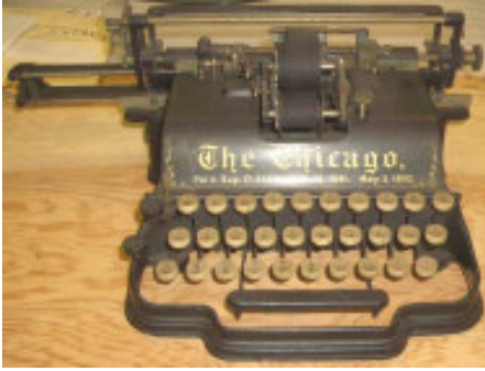
"The Chicago" typewriter, patent dates 1889, 1891 and 1892.