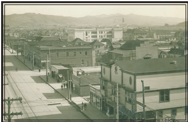
Macdonald Ave. & 6th St., Richmond. Aerial view east, ca. 1913.

With the 1942 Internment order, all of the Japanese American families of Richmond had to leave their businesses and homes. Some were fortunate in providing for the continuation of their flower nurseries for the duration of the war and returned to the greenhouses and plants they had left behind at war's end, but many never resumed their work in the industry. One hundred years after the founding of the first nursery, the gardens ceased operation and the site of many nurseries has since been marked for redevelopment. Glass and wooden structures that had been constructed in the early days of the cut flower business, most in disrepair, remain today as unoccupied reminders of a viable community of Japanese American growers.