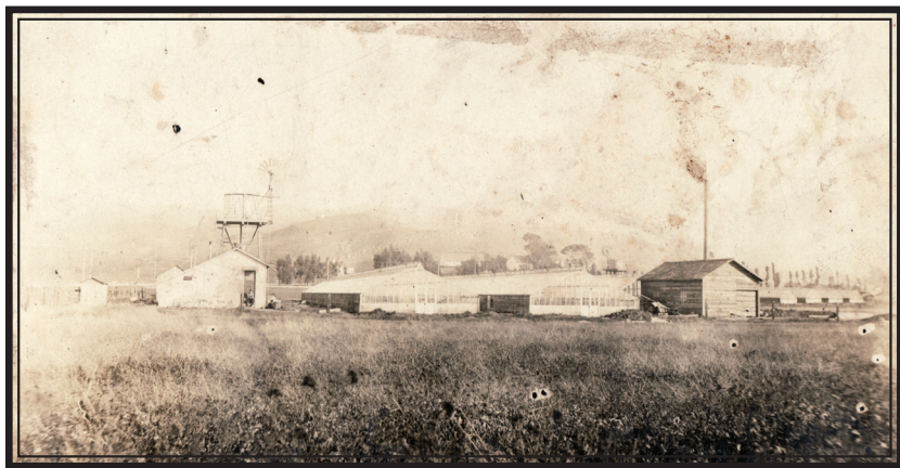
Early photo of Richmond greenhouses, pre-war.

This exhibit, One Small Story, is a visual presentation of Richmond's story of the cut flower industry owned and operated by Japanese American families for over 100 years. As early as 1906