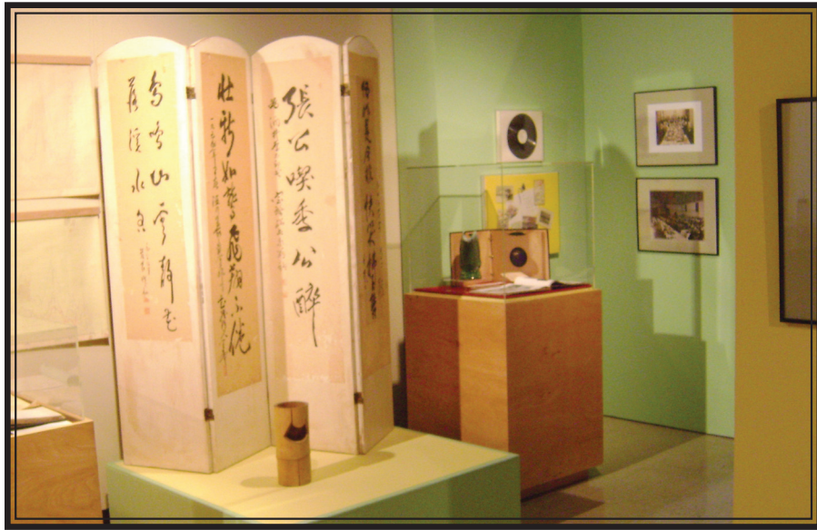
Richmond Museum of History, Seaver Gallery. September, 2010.